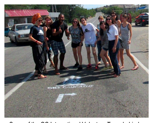
Some of the OC International Volunteer Team behind One Caucasus road sign at Shulaveri crossing (2015).