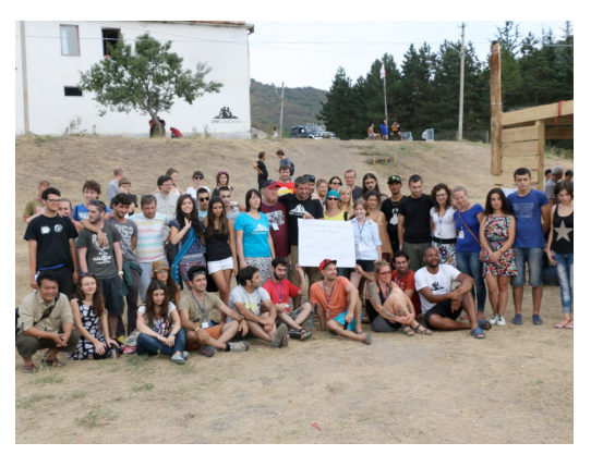
Human rights action organized by Amnesty International USA Local Group # 133