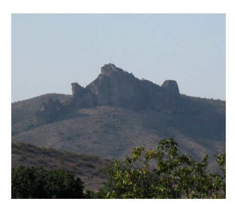
Shulaveri turning point. Going from Tbilisi before this rock: Surdash ( sur – Armenian: sharp, dash – Azerbaijani: stone) you turn right for Tserakvi.

One Caucasus Festival is held in Tserakvi in Marneuli region. Tserakvi is a small village in the end of the road that starts at Shulaveri crossing (Shulaveri is located on the main road from Tbilisi to Yerevan, around 12 km after leaving Marneuli). The road from Shulaveri to Tserakvi is an example of the multicultural profile of the whole region: from Shulaveri you go through Shaumiani (the biggest Armenian village in Marneuli), Akulari (one of the many Azerbaijani villages in the region), Sioni (with Georgian majority and Armenian minority). Tserakvi is populated mainly by Georgians – including Svans relocated from Svaneti region.