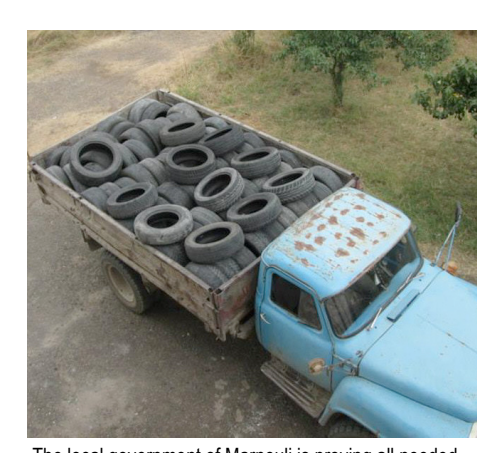
The local government of Marneuli is proving all needed support in creating One Caucasus Town – including proving digger, roller, transport of material, etc.