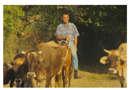
The One Caucasus out-door Living Zone must be first protected from the herd of cows that every day travel from the local fields to one of the farms.

The architecture teams will have at their disposal the wood saved and stored after previous editions of the Festival and support of One Caucasus Team. The success of their work will depend also on the ability to cooperation with other teams (both: architecture teams from other countries and content-related interdisciplinary teams responsible for programming One Caucasus Town). You can watch the video of how the first One Caucasus Town was created - https://youtu.be/V9wXYWzK_IY.