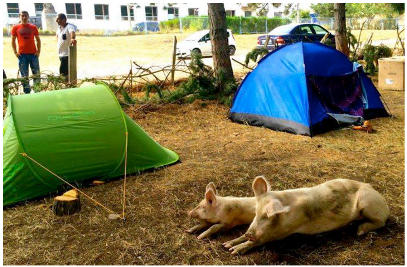
Peaceful co-existence of various species in One Caucasus Living Zone