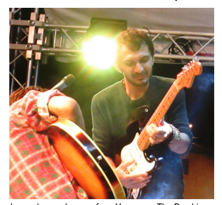
Legendary rock group from Yerevan – The Bambir – jamming together with Baku-based band: The Bom.

Caucasus goal (and practical experience!) is to unite people through art and common work - not to take the position of conflict mediator.