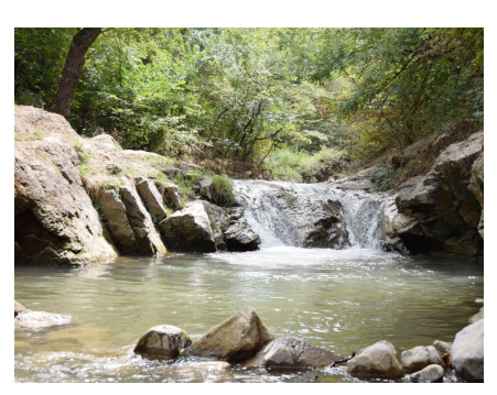
The mountain river place nearby Tserakvi – Natural Jacuzzi used by volunteers of One Caucasus.