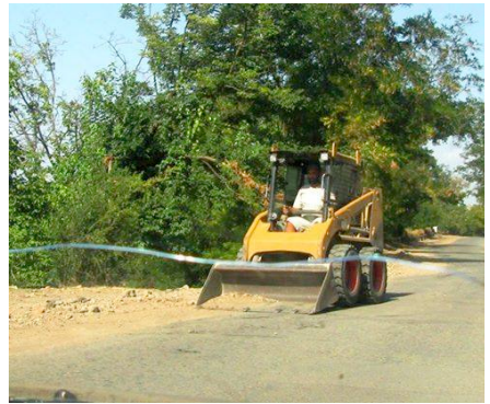
Local government of Marneuli organized work roads to improve the road to Tserakvi before One Caucasus 2014.

If you want to learn more about Tserakvi – watch films created by professional film-makers and culture animators from Ukraine, Georgia and Poland – the volunteers of One Caucasus: Tserakvi (2014) - <a href="https://youtu.be/00J0BLJgFNc">https://youtu.be/00J0BLJgFNc</a> & Humans of Tserakvi (2015) - <a href="https://youtu.be/IYisJGnzxrs">https://youtu.be/IYisJGnzxrs</a>.