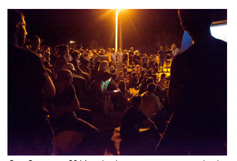
One Caucasus 2014 main cinema zone was organized in Transformer (multifunctional truck provided by Yerevan-based art NGO Utopiana)